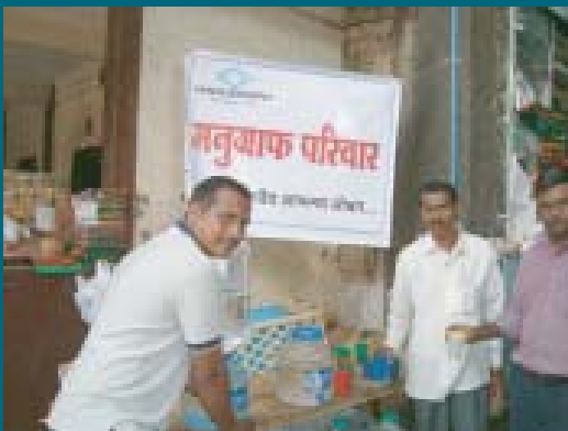
Mineral water distribution to devotees during the Navratri Festival