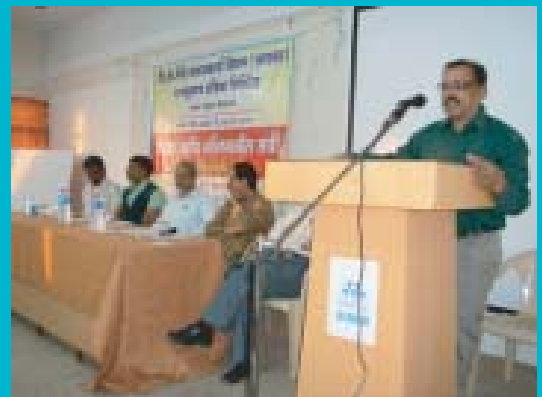
Career guidance program