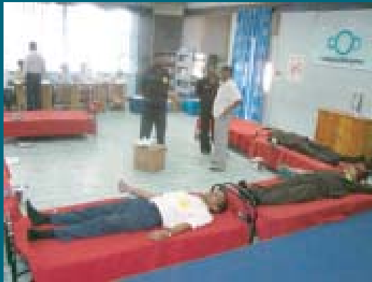
One of a series of regular Blood Donation camps that are sponsored by us

Across the world, Manugraphers are pursuing new ideas, challenging old ways of thinking, and asking the vital question about what else they can do to improve, not just machine productivity, but the quality of life in the communities we live in. In cooperation with others like customers and suppliers, new ideas are being tested, best practices are being implemented, and ways to maximize Manugraph's positive impact in the world are being sought.